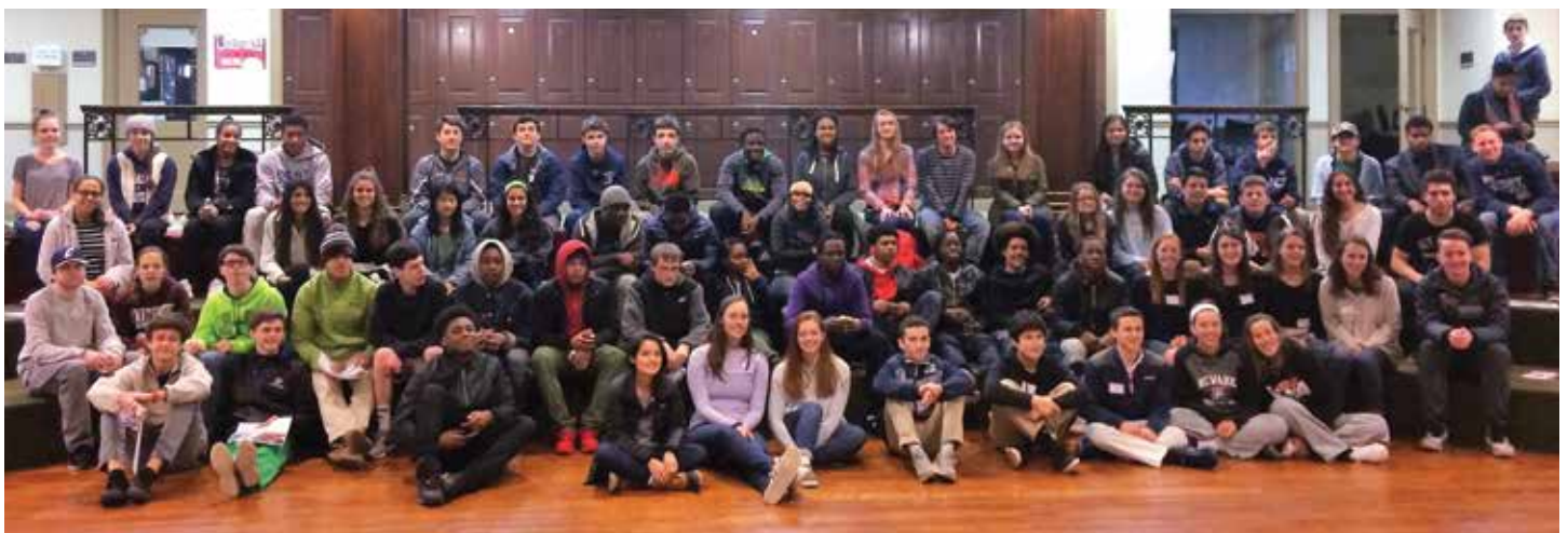
Some of the attendees at the teen conference.

This year's theme for the conference was "Changing Perspectives." The committee created interactive games to illustrate the challenges faced by people experiencing homeless. Teens from the Emergency Residence at the Newark YMCA spoke to the group about their experiences and offered advice to our students. The closing speaker was a young man who was formerly homeless and is currently living at Covenant House while attending college with aspirations of becoming a concert cellist. It was an educational and emotional afternoon.