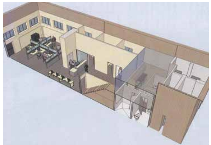
Drawing of Halsey Street building by Rosen Kelly Conway Architecture & Design.

Project Connect is moving to 35 Halsey Street in Newark in the fall of 2017. Services will expand its services to include on-site medical care and a mental health clinician through its partnership with St. James Health. The facility will also include an ADA restroom and shower. Project Connect case managers provide wrap around services. Our case managers will engage in street outreach to remote areas frequented by the City of Newark’s most vulnerable population including: soup kitchens, the Newark Public Library, Penn Station and hospitals.