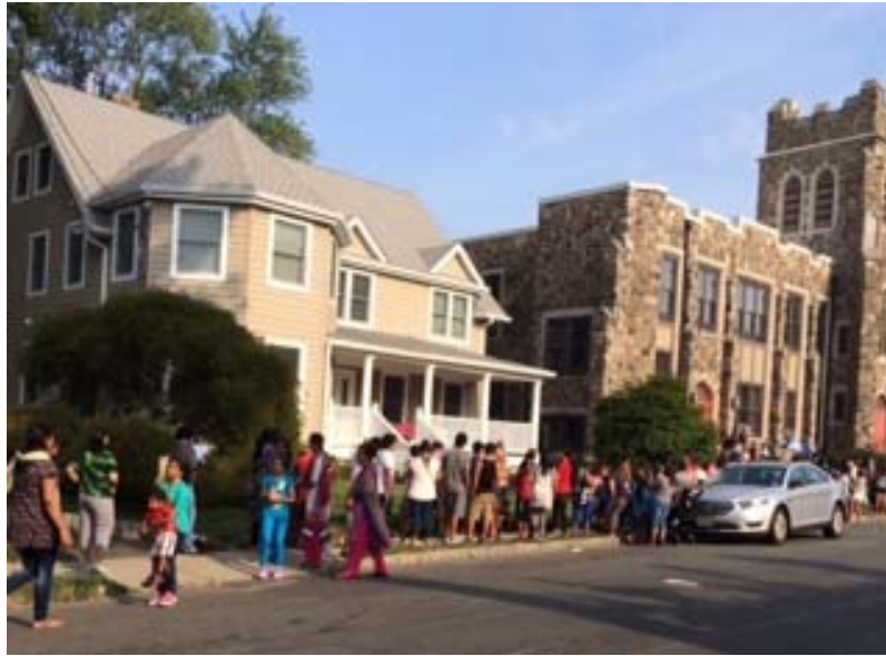
People lined up down the street on both of the School Supplies Distribution.