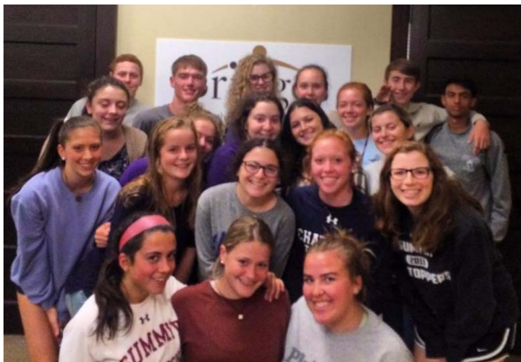
Some of the members of this year's Teens Tackle Homelessness Group